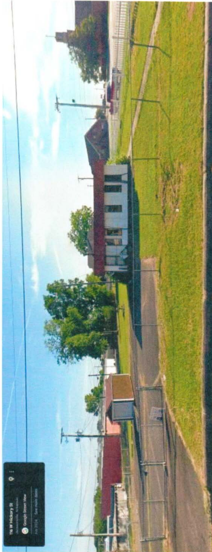
*This is a photo of the property at 116 W Hickory Street at the time of purchase. The building was dilapidated and was rotting from the inside out.